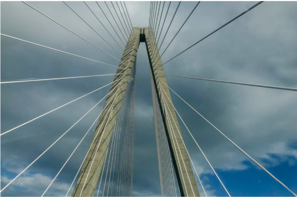
1st Expert: "Looking into the Heavens" by Sophia Schade

Winning images are now on display in the Photography Club studio window. Congratulations to All!