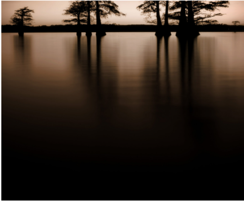
"Caddo Trees," Gerry Fagan