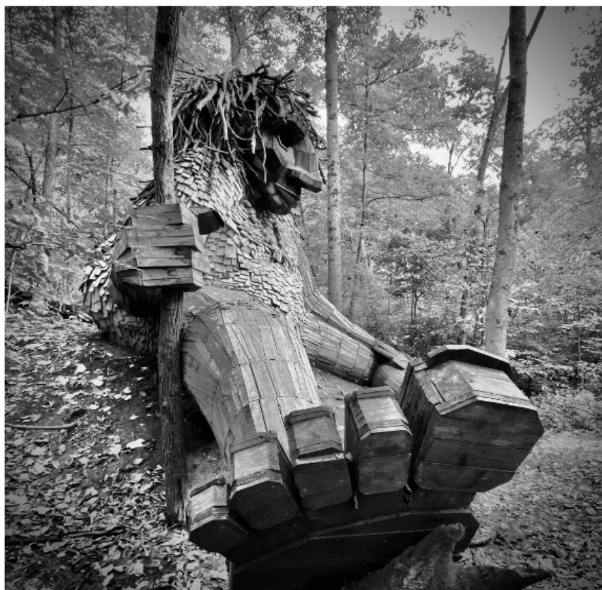
"TOES of a TROLL," Dolly Jankord

As a result of the November competition, the following people have been advanced to the next higher competition category: