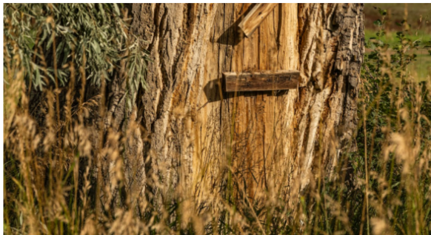
"The Forgotten Tree on the LoBo Trail," Barb Puceta