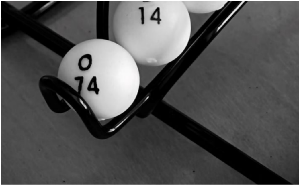
Dolly Jankord, "Bingo"