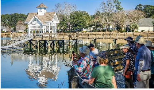
Lake Somerset Walk Around - Phone Cameras

Finally, summer is coming to a close and I am looking forward to welcoming the cooler weather. Even though the summer has been a very hot one, the Education Committee has been hard at work bringing our membership many diverse Summer Pop-ups. There were ten in total and many of our member summer residents took advantage of them.