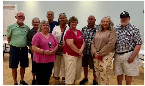
September Competition Winners "Slanted/Incline"