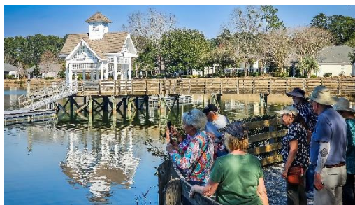
Lake Somerset Walk Around - Phone Cameras

Welcome to the Fall Semester which runs through November 24th. You should have already received the Fall Semester catalog and registration link by email. This information is also available on the club's website pcschh.org under Programs and Education where you will find all the details you need to register for an upcoming class.