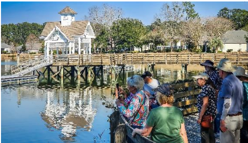
Lake Somerset Walk Around - Phone Cameras

It's hard to believe that the Fall Semester has ended. I hope you were able to enjoy one or more of the many diverse classes offered. If not, there are more coming right after the holidays. The Winter Semester will run from January 26 through March 27. The timeframe for the Semester registration is as follows: