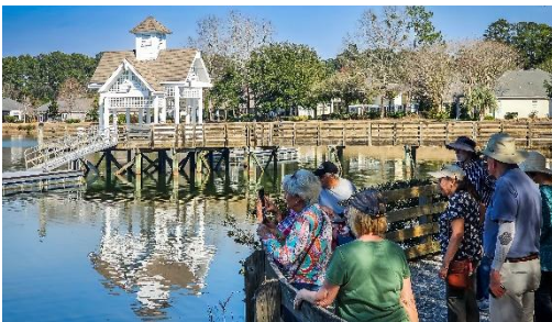
Lake Somerset Walk Around - Phone Cameras