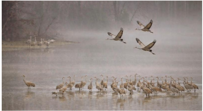
In the Fog of an Alabama Morning Thousands of Sandhill Cranes

Her compelling image ‘In the Fog of an Alabama Morning Thousands of Sandhill Cranes’ earned 1st Place — Best of the Month for January 2026 in the Global Photographers Network Online Awards, a prestigious international distinction.