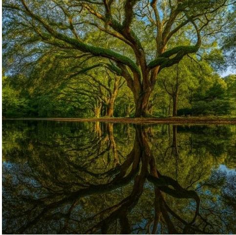
1st Place 'Reflection – Aiken SC'