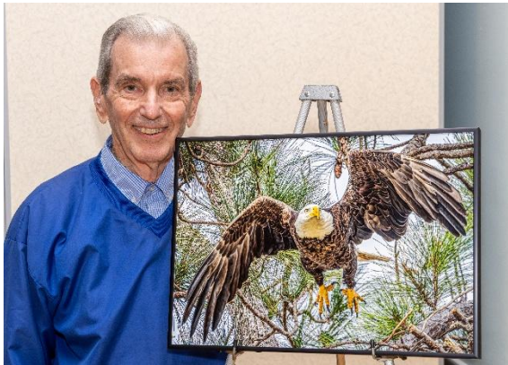
First Place Photography

In the Photography category itself, Corky captured First Place with ‘Leaving for Food,’ while Mike earned Second Place for ‘Starry Night.’ Their images stood strongly on their own and also reinforced the depth of talent within our membership.