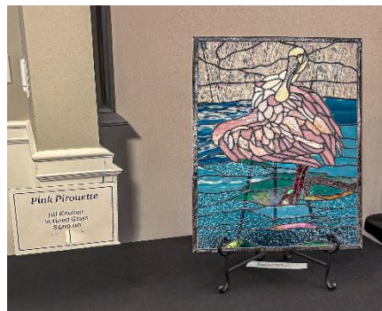
First Place Glass