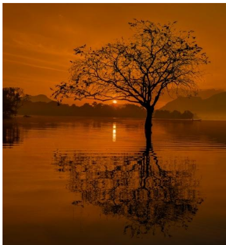
2nd Place 'Magical Morning'

She also earned a 2nd Place Tier 1 CNPA award for 'Magical Morning' (Landscape) and a 3rd Place Tier 1 CNPA award in Birds for 'Lunch Time.'