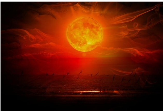
1st Place ‘Moon Rise’

She captured four CNPA 1st Place Tier 1 awards for ‘Moon Rise’ (Artistic), ‘Flower in Water Drop’ (Small Stuff), ‘Reflection-Aiken SC’ (Landscape), and ‘Having Fun With Water Drops’ (Birds).