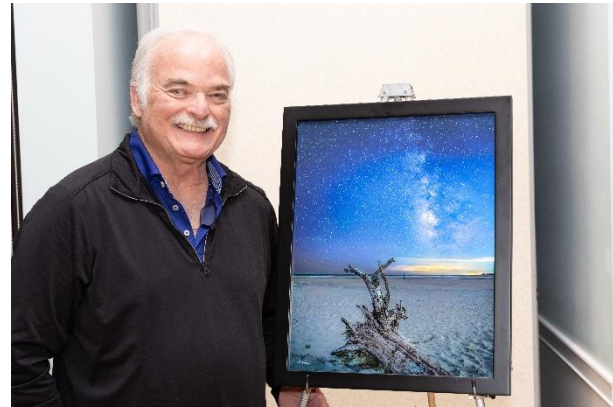
Second Place Photography

This year, 73 photographers from our club participated — forming the foundation of Creative Vision. From those 73 images, 61 artists, eight glasscrafters, and four woodworkers created original interpretations. That is what makes this exhibition so distinctive: every brushstroke, every glass design, every carved detail begins with one of our photographs.