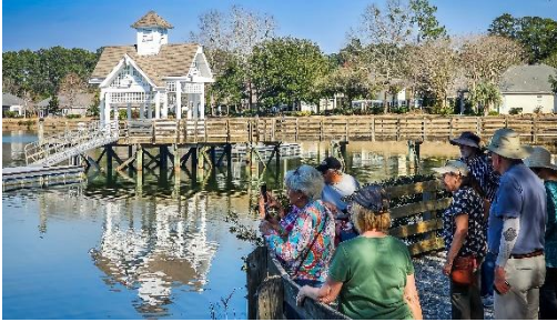
Lake Somerset Walk Around - Phone Cameras

As we reach the midpoint of the Winter Semester, we're beginning to turn our attention toward the Spring. Our team has been thoughtfully curating a selection of classes designed to support photographers at every stage - whether you're building foundational skills, exploring new creative directions, or looking to deepen your technical understanding. This upcoming lineup reflects what our members have been asking for: practical learning, inspiring challenges, and opportunities to grow alongside a supportive community. The Spring catalog will be sent to all members via listserv on March 16. Registration opens March 23, and Spring classes will run from March 30 through June 12. We're excited to share what's ahead and to continue walking with you on your photography journey.