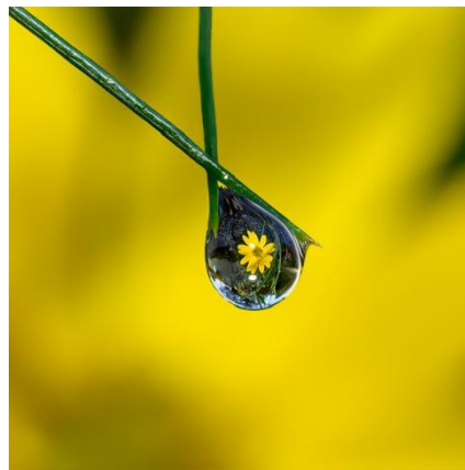
1st Place ‘Flower in Water Drop’