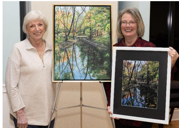
Second Place Pairing