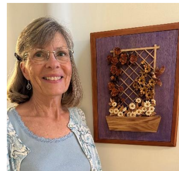
First Place Wood