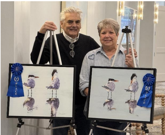
First Place Pairing